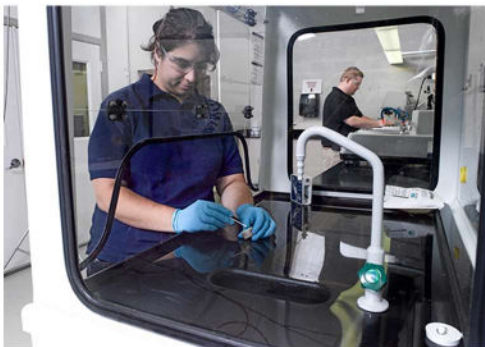
Met Lab for on-site metallographic analysis.