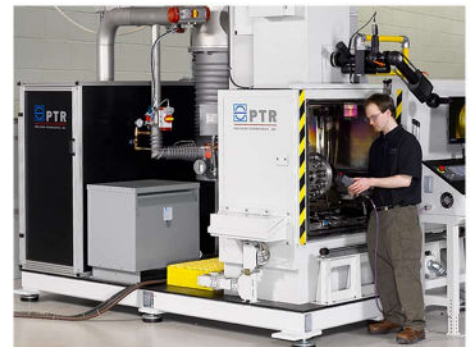
Job Shop EB Welding system with full CNC control & multi-spindle fixture.